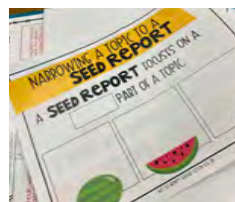
Informational writing materials